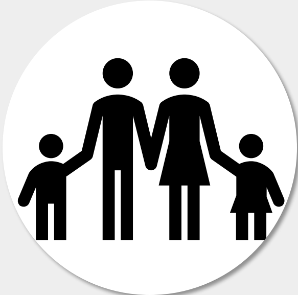
Family-Centered Community Collaboration